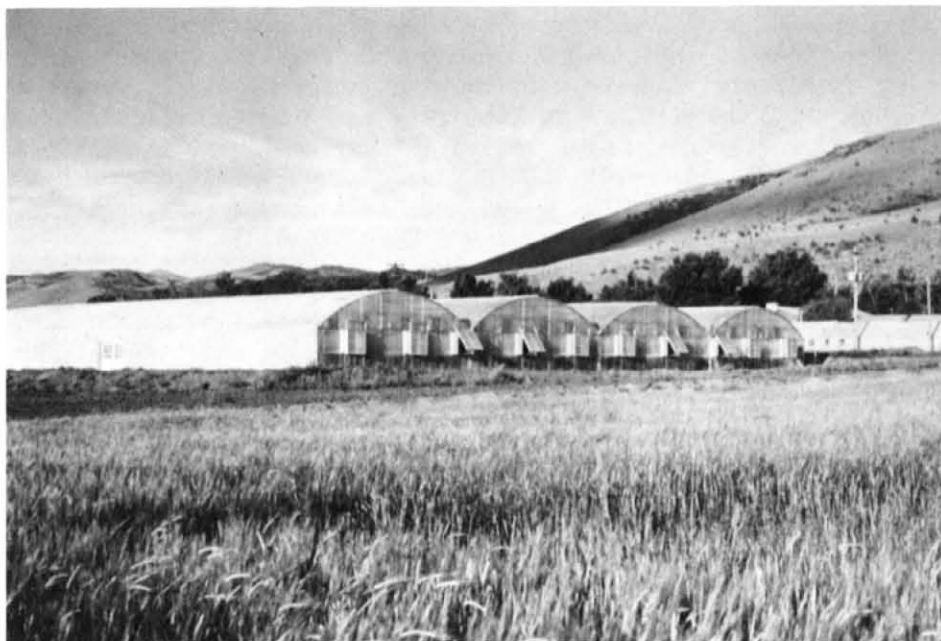
Figure 6. Lakeview greenhouse heated by geothermal energy.