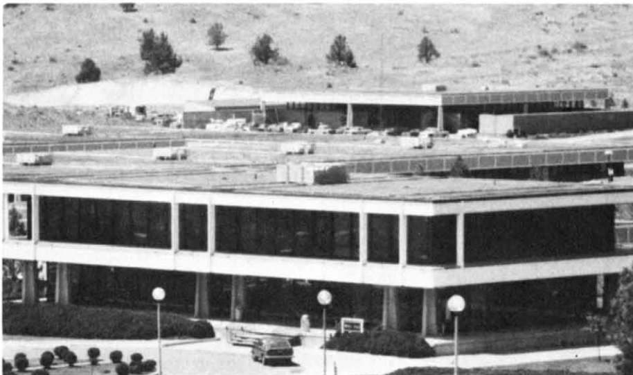
Figure 5. Snell Hall, Oregon Institute of Technology, Klamath Falls. All nine OIT campus buildings are heated by geothermal energy.