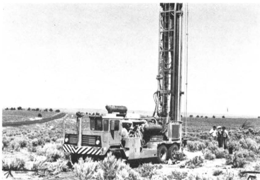
Figure 3. Drilling rig at site of heat-flow hole near Riley Junction in Harney County.