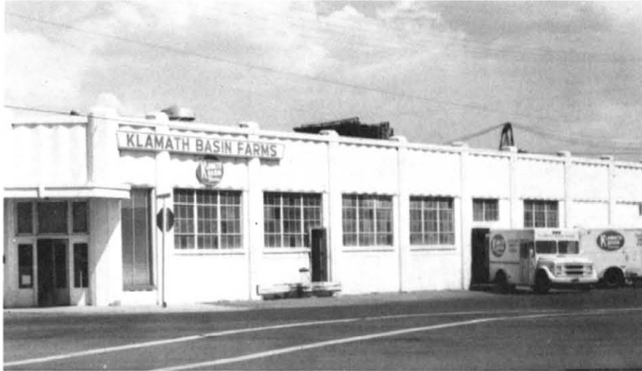
Figure 4. Klamath Falls dairy which uses natural hot water for pasteurization.