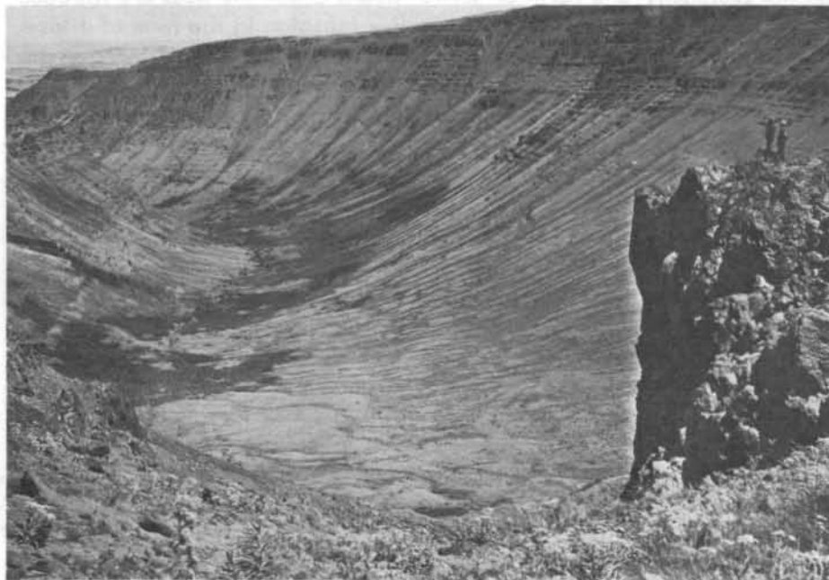
Figure 6. Kiger Gorge. Steens Basalt flows are well displayed in the canyon walls.