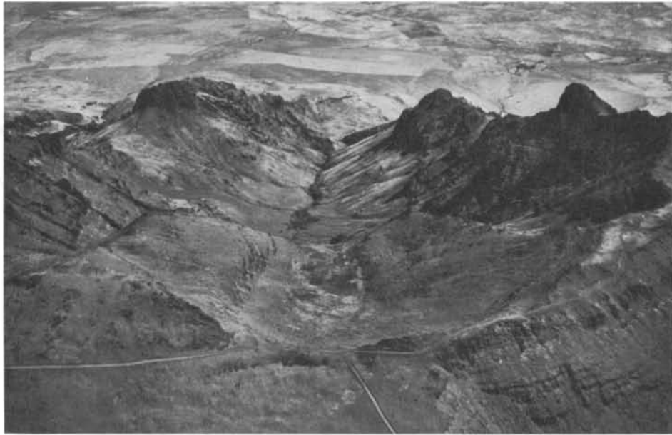
Figure 9. Large cirque on the east scarp at the head of Alvord Creek. A narrow ridge, an arête, separates it from Wild-horse Canyon (lower right corner).