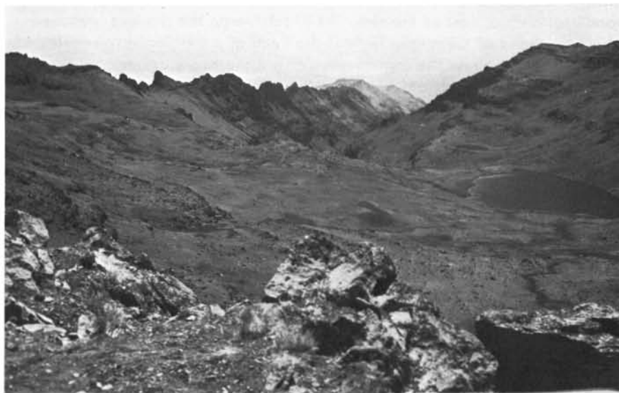
Figure 12. Wildhorse Lake occupies a bedrock depression in the cirque at the head of Wildhorse Canyon.