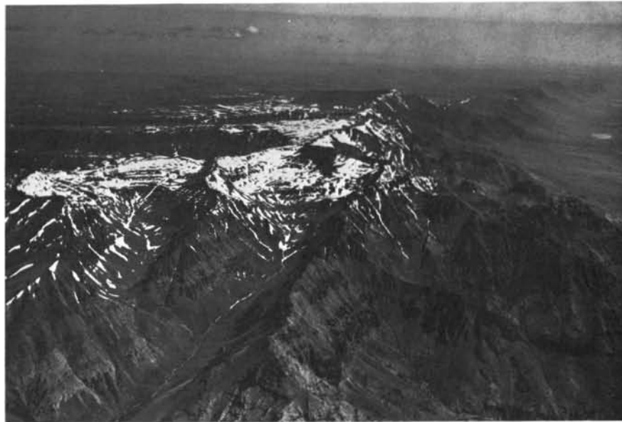
Figure 1. High Steens viewed from the south. Wildhorse Canyon and Little Wildhorse Canyon are in lower-left quarter of photograph.