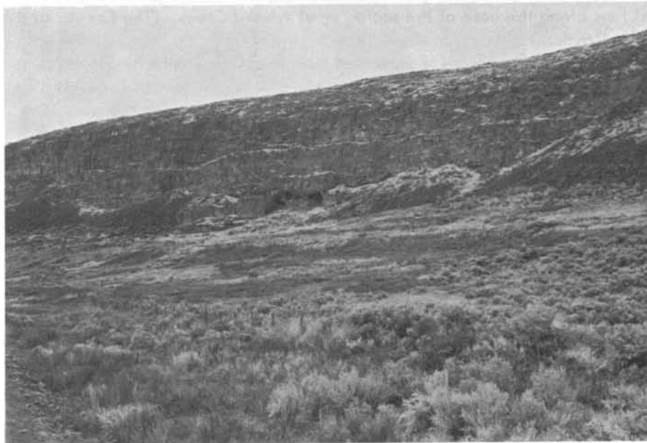
Figure 4. Catlow Rim near Roaring Springs Ranch. Caves near the base of the scarp were once occupied by Indians.