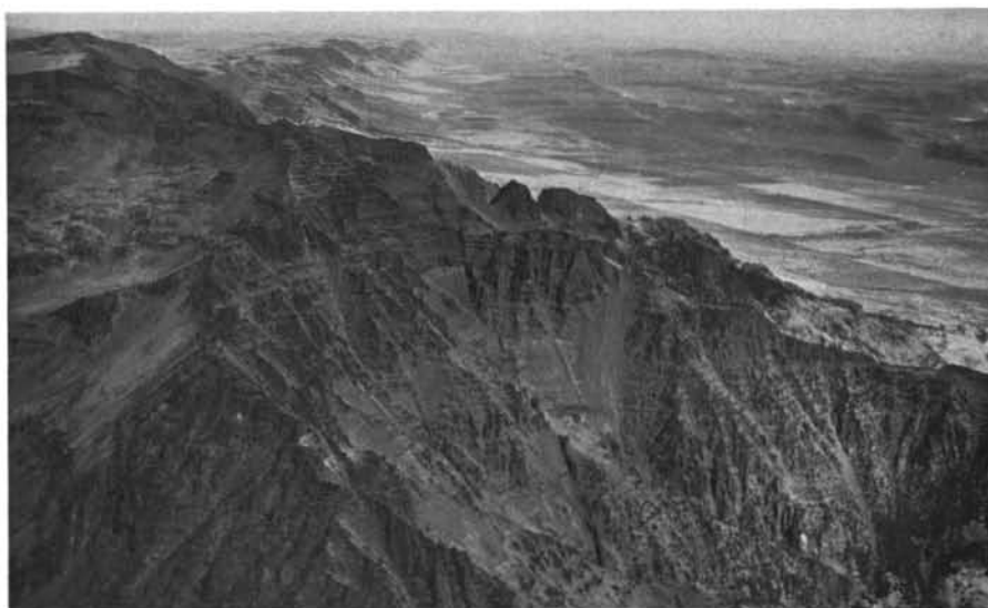
Figure 2. Central part of High Steens with Northern Steens in the distance. A small fault block lies east of and parallel to the Northern Steens. Note dike in center of photo.