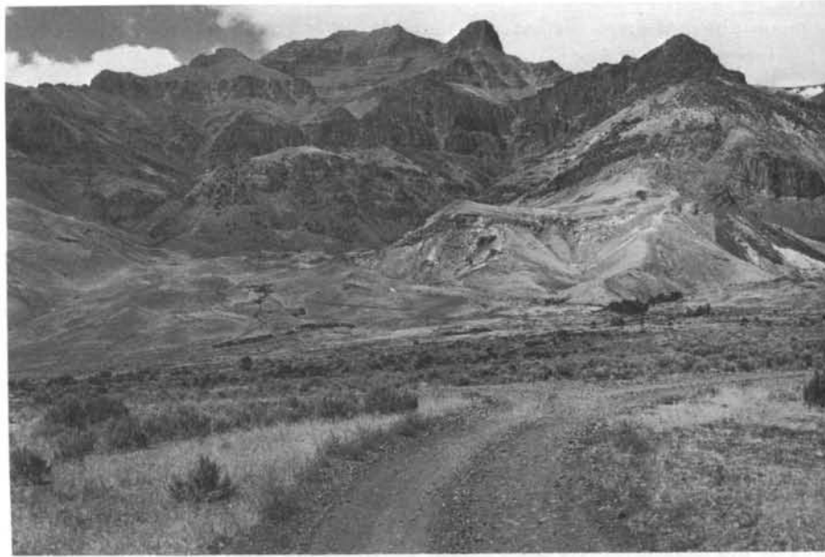
Figure 3. High Steens from the Alvord Ranch. Alvord Creek beds make up the foothills and are overlain by the Steens Mountain Andesite Series. (Ore. Hwy. Div. photo)