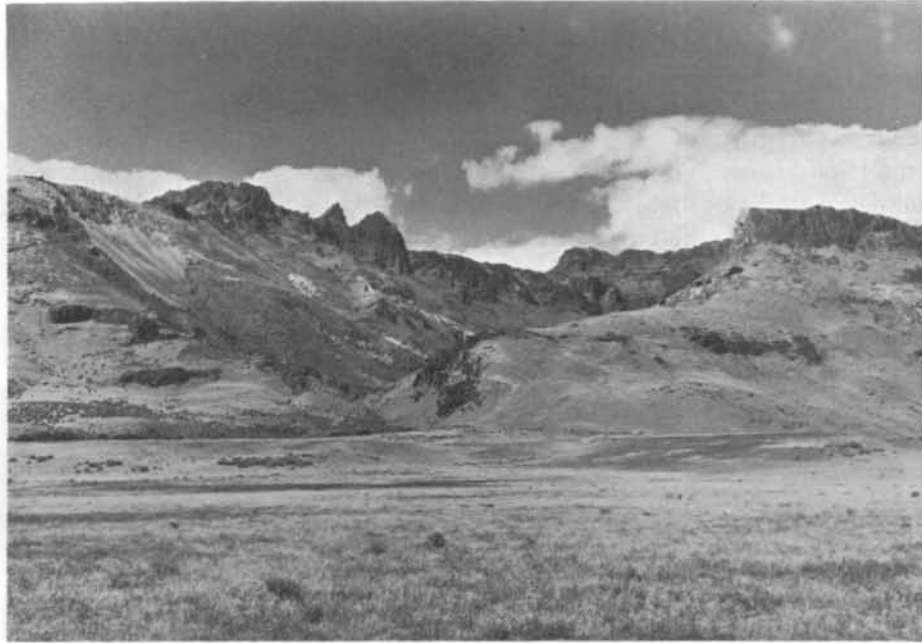
Figure 5. Pike Creek Formation at the mouth of Pike Creek Canyon. (Ore. Hwy. Div. photo)