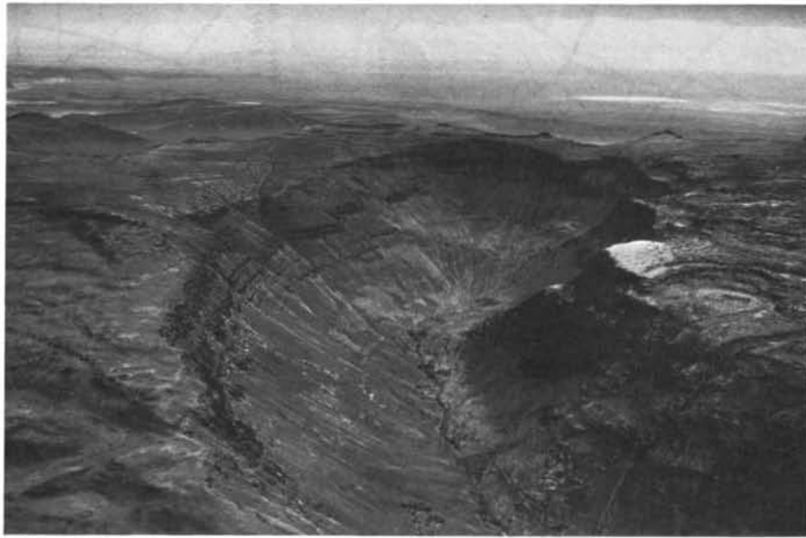
Figure 7. View east up Little Blitzen Canyon. Alvord Desert in far right distance.