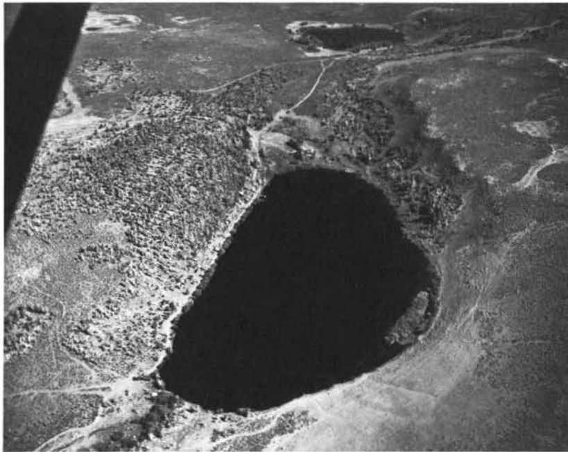
Figure 11. Fish Lake and the smaller lake above it are impounded by glacial moraine.