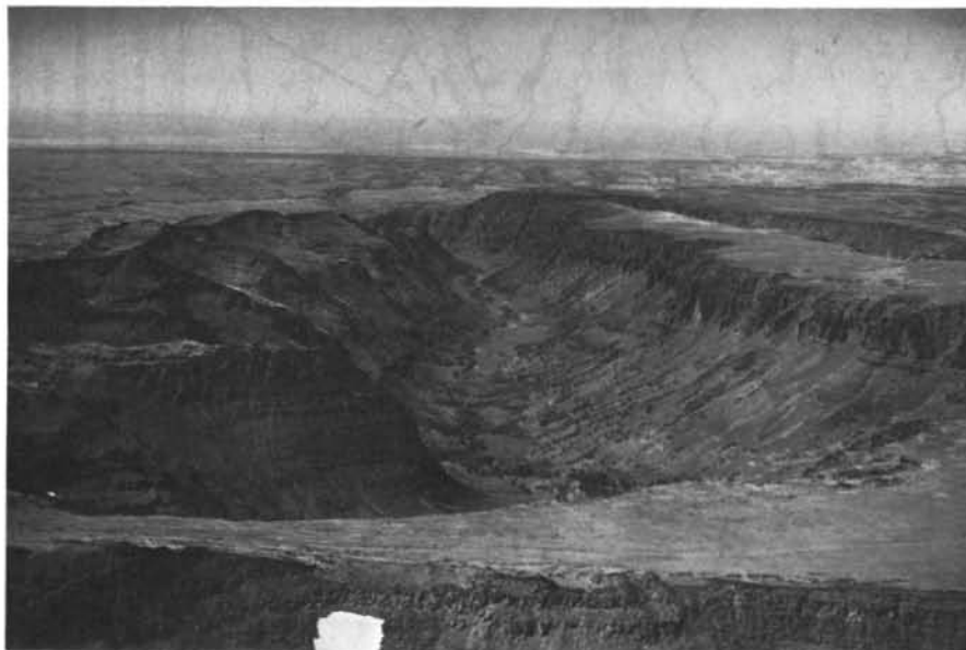
Figure 8. Narrow wall separates east scarp from Big Indian Canyon (white patch in foreground is snow clinging to east scarp). Smith Flat in background.