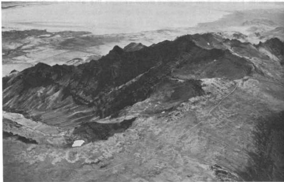
Figure 10. Small cirques around the upper edge of the large cirque at the head of Alvord Creek. Alvord Desert, a playa, is in the distance.