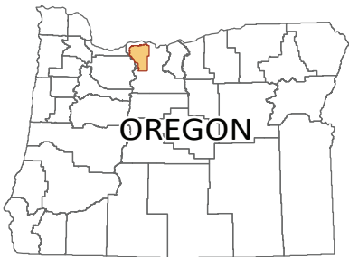
Study Loca on Map

The lood hazard data show areas expected to be inundated during a 100-year lood event. Flooding sources include riverine. Areas are consistent with the regulatory lood zones depicted in Hood River County’s Digital Flood Insurance Rate Maps.