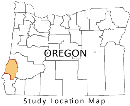
Study Location Map

Data Sources: Flood hazard zone (100-year): Coos County Flood Insurance Rate Map (2018) Roads: Oregon Department of Transportation (2014) Place names: U.S. Geological Survey Geographic Names Information System (2015) City limits: Oregon Department of Transportation (2014) Basemap: U.S. Geological Survey and Oregon Lidar Consortium (2012) Hydrography: U.S. Geological Survey National Hydrography Dataset (2017) Projection: NAD 1983 UTM Zone 10N Software: Esri® ArcMap 10, Adobe® Illustrator CS6 Cartography by: Lowell H. Anthony, 2018